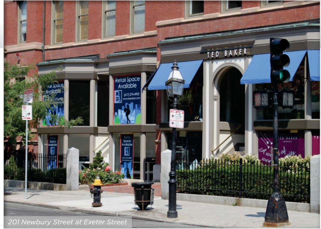
201 Newbury Street at Exeter Street